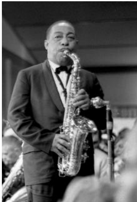
June 1963, Borlänge